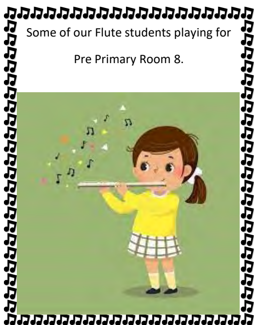
Some of our Flute students playing for Pre Primary Room 8.